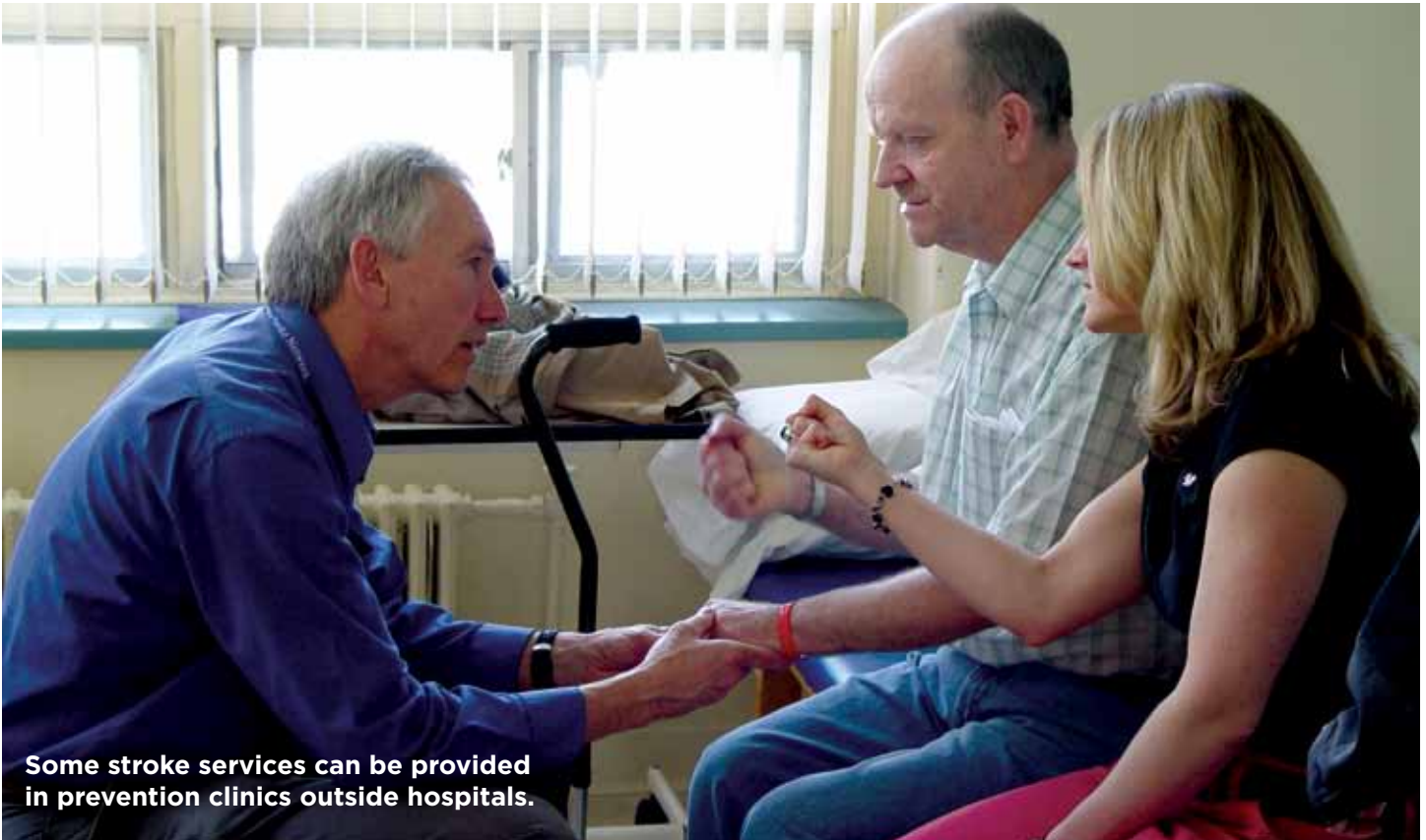
Some stroke services can be provided in prevention clinics outside hospitals.