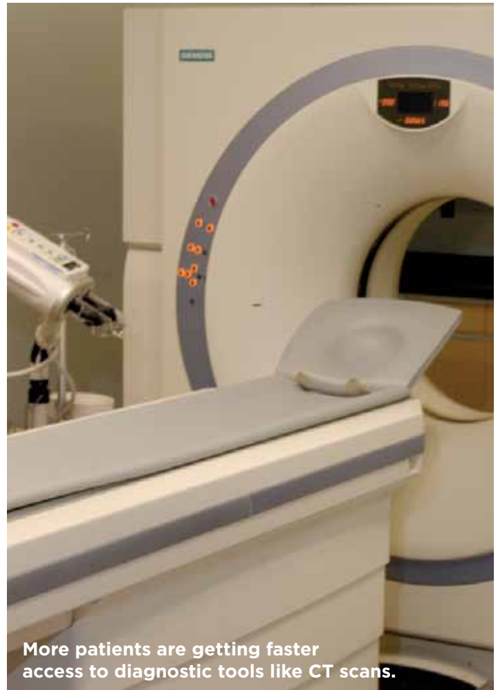
More patients are getting faster access to diagnostic tools like CT scans.

Half of stroke patients take almost six hours after symptom onset to arrival at hospital. Times are