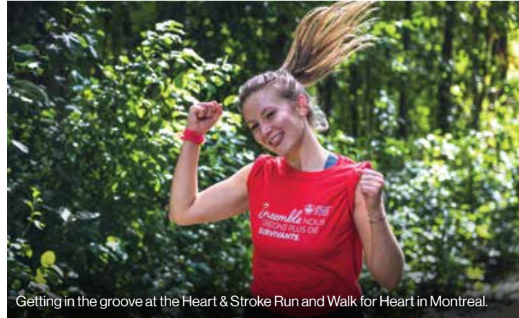
Getting in the groove at the Heart & Stroke Run and Walk for Heart in Montreal.