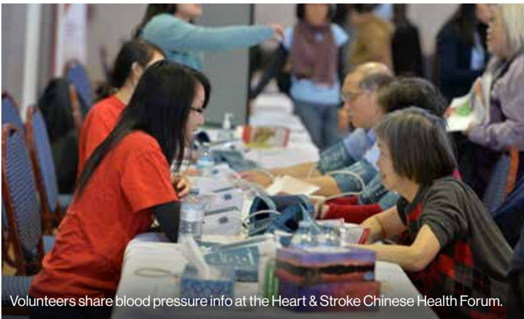
Volunteers share blood pressure info at the Heart & Stroke Chinese Health Forum.