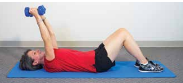
© Heart and Stroke Foundation of Canada