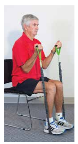
© Heart and Stroke Foundation of Canada

1. Place your feet in the middle of the resistance band. Hold an end in each hand.