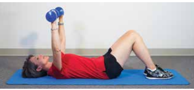
© Heart and Stroke Foundation of Canada