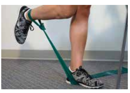
Heart and Stroke Foundation of Canada