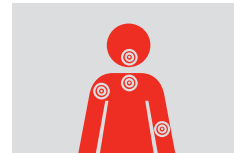
Upper body discomfort