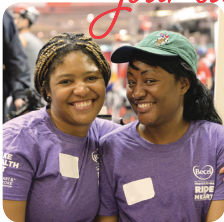
Volunteers including those pictured on this page keep the Foundation's heart beating.